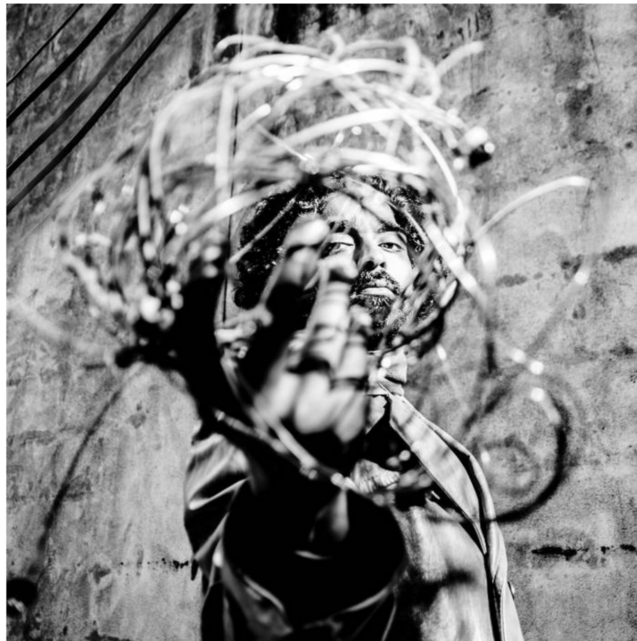
Newe Los Angeles Shift Seven